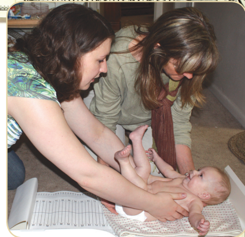
Our Nurse Family Partnership nurse measures baby with mom during home visit

DID YOU KNOW that our NFP nurses worked with more than 60 families in La Plata and Archuleta counties during 2012?