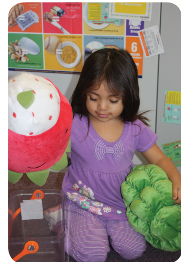
Child with a strawberry and broccoli during her mom's visit to our WIC office

DID YOU KNOW our WIC Breast-feeding Peer Counselors supported 150 moms in 2012 and our program served an average of 1075 participants per month?