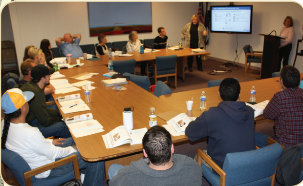
Our Environmental Health staff trains local food handlers and managers in food safety

DID YOU KNOW that we inspected 715 food establishments in La Plata and Archuleta counties, trained 137 food handlers in food safety, and investigated 10 food-borne illnesses in 2012?