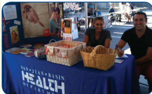
Our staff provides educational outreach on FLC campus about birth control, unplanned pregnancy and STDs

Routine childhood immunizations save 33,000 lives; prevent 14 million cases of disease; and saves $9.9 million 5 in direct health care costs. DID YOU KNOW that we provided more than 2,000 childhood immunizations in 2012?